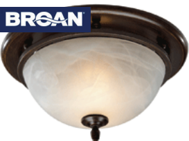
FAN & LIGHT COMBO! 754RB LIST PRICE - $180.34

Imagine, a high performance ventilation fan that's a stylish, decorative light fixture. Broan fans are available in five, corrosion-resistant decorator finishes: oil-rubbed bronze, antique crackle nutmeg, pewter, satin nickel and white. Powerful fans exhaust 70 or 80 cubic feet of air per minute via inconspicuous vent openings in fixture base and feature 3.5 or 2.5 sones respectively for quiet operation. All Broan decorative fan/lights include the following features: Corrosion-resistant finish, Plug-in light fixture assembly, permanently lubricated motor, Polymeric blower wheel, Rugged,